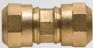
3-part unions, 1/8" & 1/4" bend couplings, "U" & "Y" branches and tees

A stainless steel gripper band overlaps itself so no gasket material can get underneath.