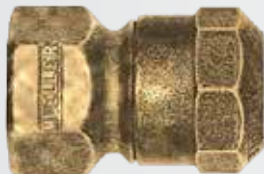
Corporation valve couplings