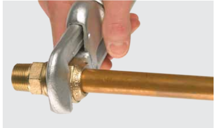
Insert the pipe and bottom out the nut